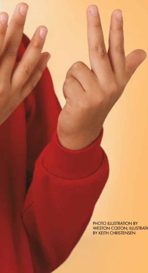
PHOTO ILLUSTRATION BY WESTON COLTON; ILLUSTRATIONS BY KEITH CHRISTENSEN

3 When you pray, be sure to thank Heavenly Father for the good things you remembered. You can also tell your family members about the blessings you found!