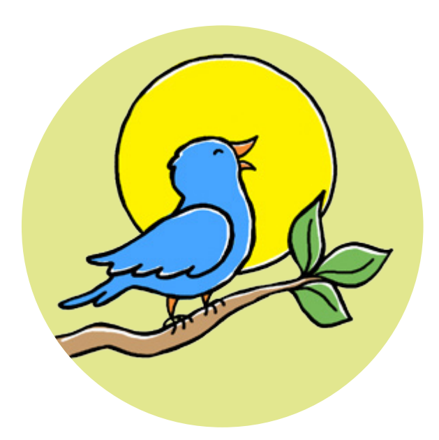
Thank Thee for the birds that sing;