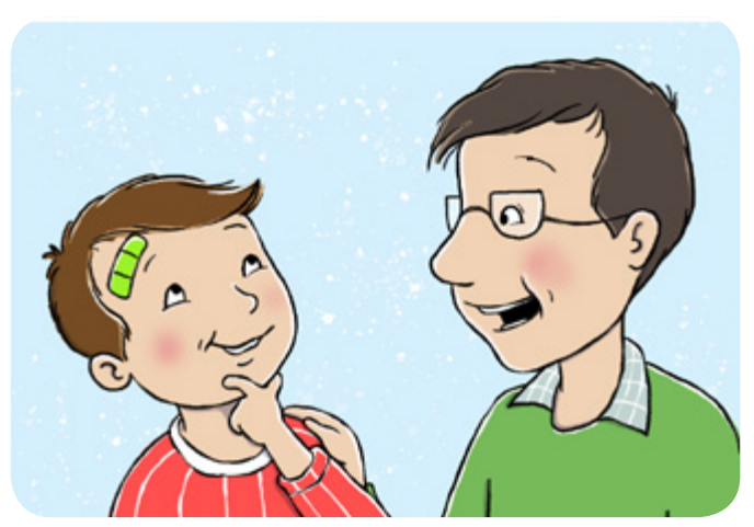
"And you can ask Heavenly Father to help you."