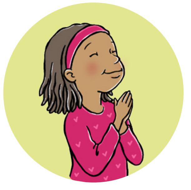
Thank Thee, God, for everything!