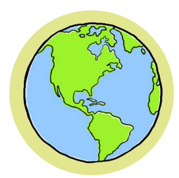
Thank Thee for the world so sweet;

What do you want to thank Heavenly Father for today?