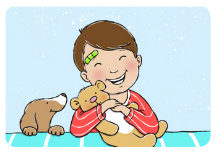
"In the name of Jesus Christ, amen."