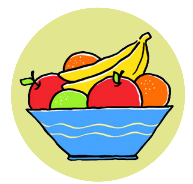
Thank Thee for the food we eat;