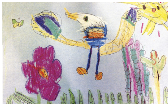
Everett L., age 7, Pennsylvania, USA