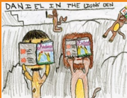
Faith A., age 10, California, USA