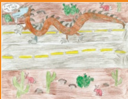
Kohler L., age 10, West Virginia, USA