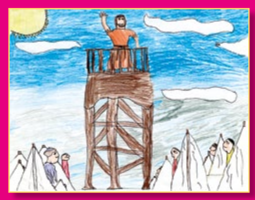
Rylan C., age 7, Utah