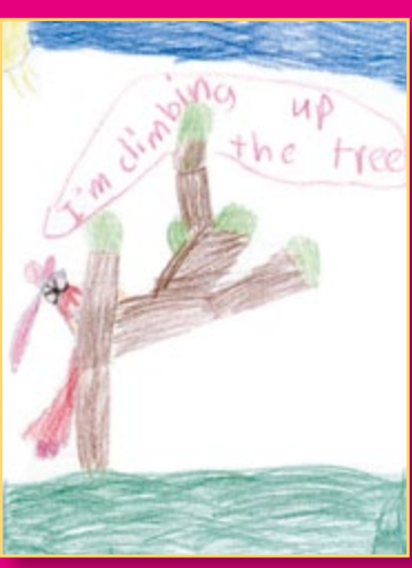
Attalia L., age 5, Queensland, Australia