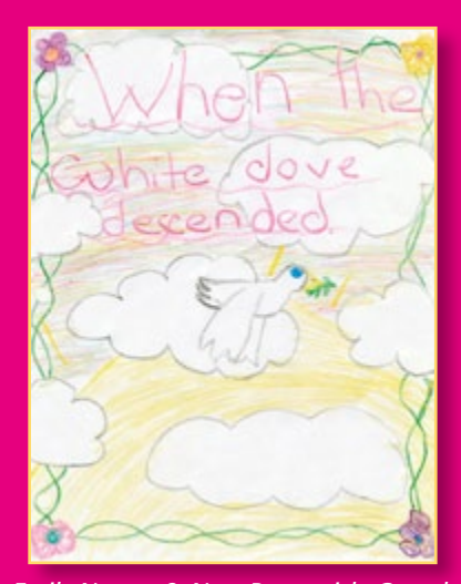
Emily N., age 9, New Brunswick, Canada