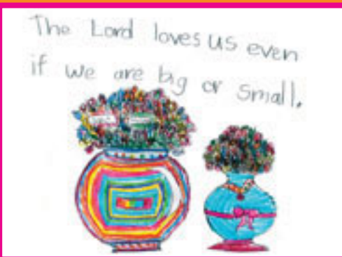
Lexie Z., age 7, Iowa