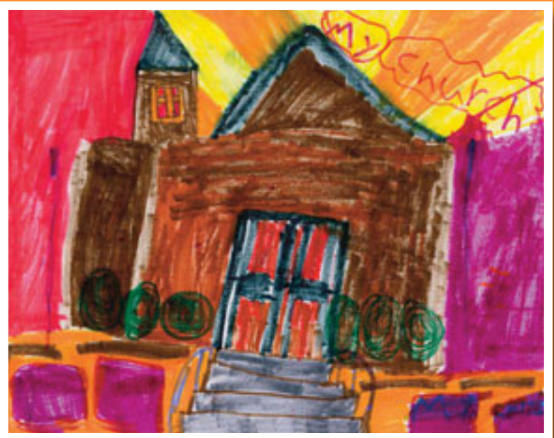
Isabella W., age 7, Ohio