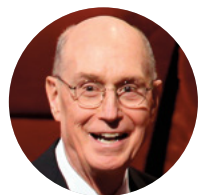
By President Henry B. Eyring Second Counselor in the First Presidency