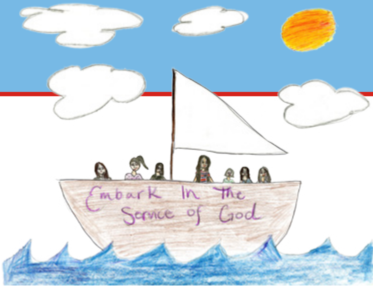
Emma B., age 11, Texas, USA