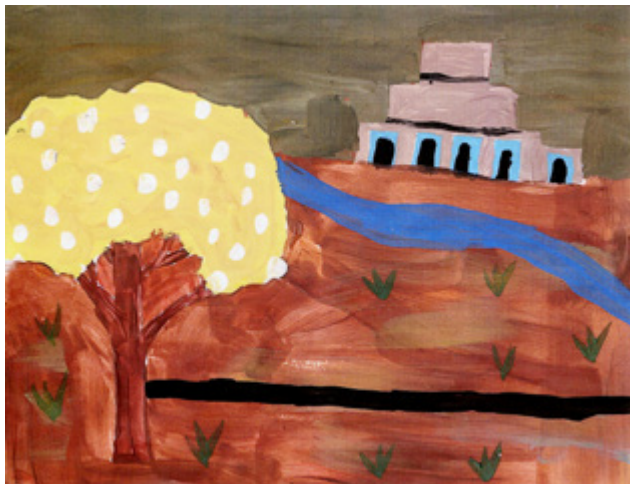
Tyler B., age 11, Utah, USA