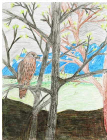
Marstan W., age 8, Colorado, USA