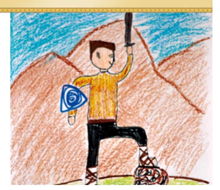
Grant L., age 10, Florida, USA