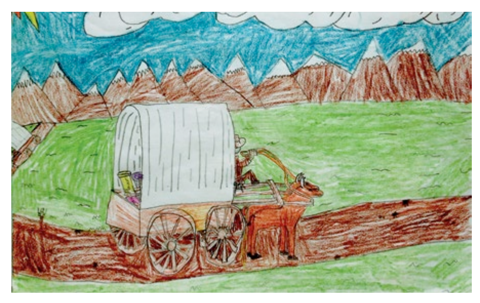
Deven B., age 10, Idaho, USA