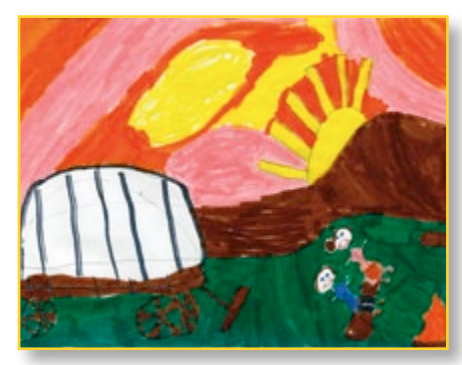
Ellisyn P., age 8, Utah, USA