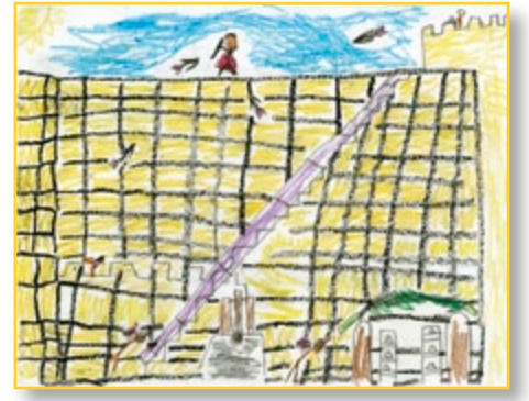
Luke B., age 7, Kansas, USA