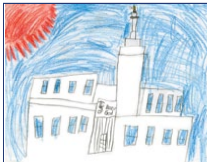
Isaac F., age 7, Alaska