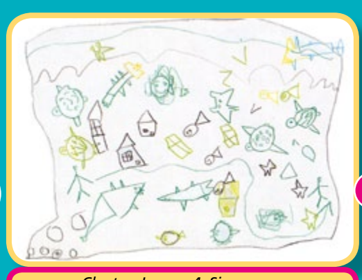
Clayton L., age 4, Singapore