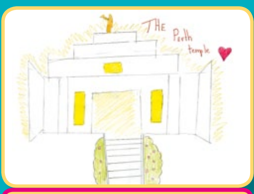
Alana P., age 11, Western Australia, Australia