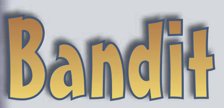
BY RAY GOLDRUP (Based on a true story)