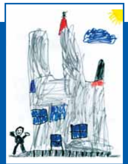
Cameron B., age 5, Arizona