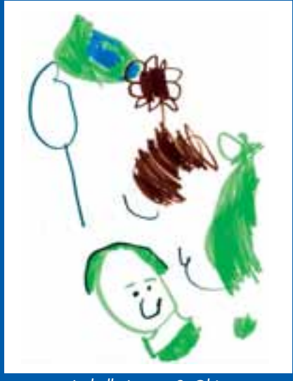
Isabella L., age 3, Ohio