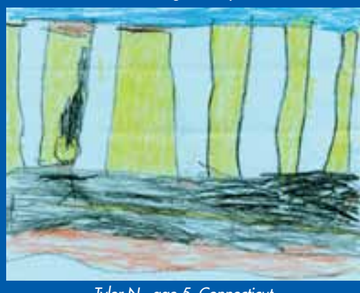
Tyler N., age 5, Connecticut