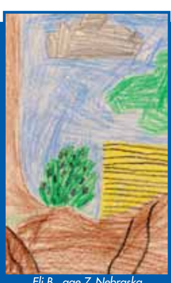
Eli B., age 7, Nebraska