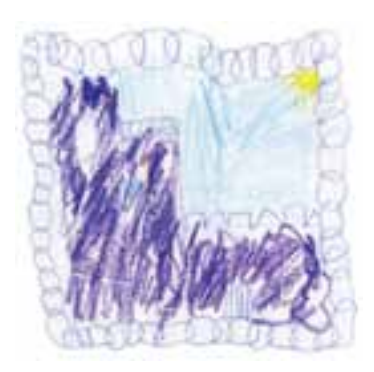
Gracie S., age 7, New Hampshire