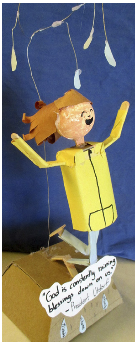
Emily P., age 9, Utah, USA