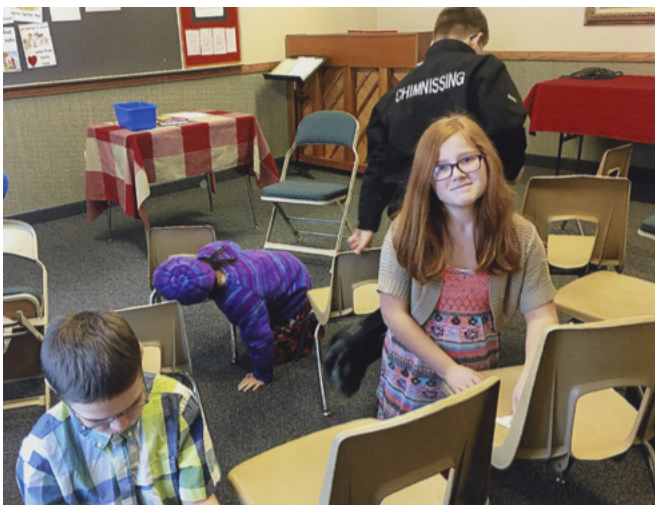
Primary children in the Midland Branch Primary, Ontario, Canada , like to help clean up the Primary room and classrooms. They enjoy bringing their friends to church and making them feel welcome.

I can't wait to be a missionary and share the gospel!