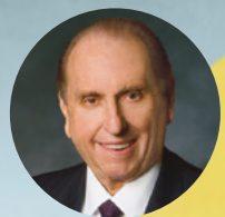
By President Thomas S. Monson