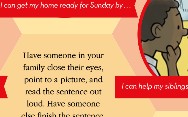
I can help my siblings get ready for Sunday by...