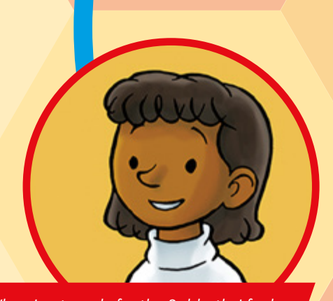
When I get ready for the Sabbath, I feel...