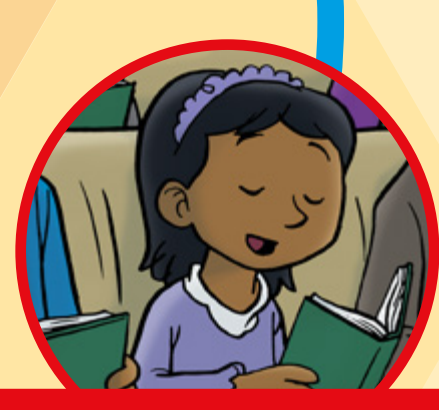
I can get ready to take the sacrament by . . .