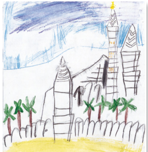
Yuzi H., age 7, Taoyuan, Taiwan

Find more art online at childart.lds.org!