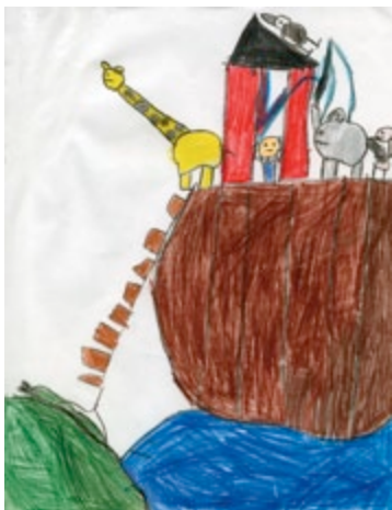
Joshua K., age 6, Utah, USA