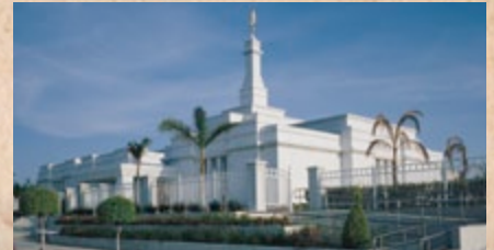
The Guadalajara Mexico Temple is the 11th of 13 temples in Mexico.