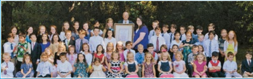
The Primary children of the Old Hickory Ward, Nashville Tennessee Stake , want to do their best to defend their gospel standards! To show their commitment, they all signed a My Gospel Standards poster and presented it to their bishop. They know that by living these standards they are preparing for the temple.

Do you have goals for the new year? Tell us about them! See page 48 to find out how to send your answer.