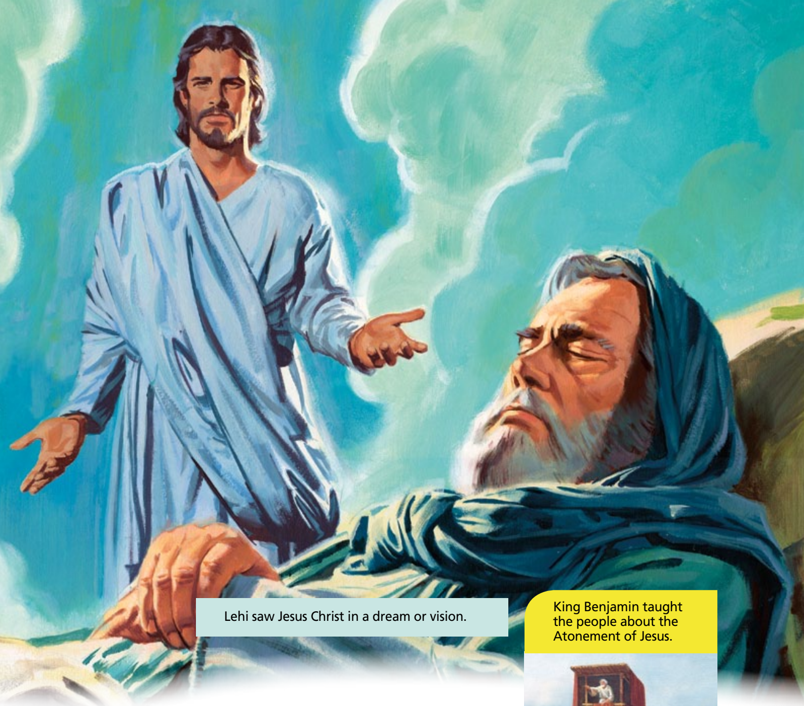
Lehi saw Jesus Christ in a dream or vision.