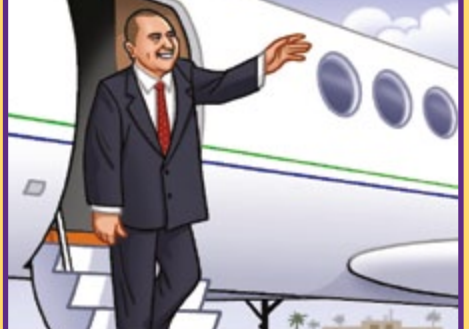
Traveling to meet Church members in many countries