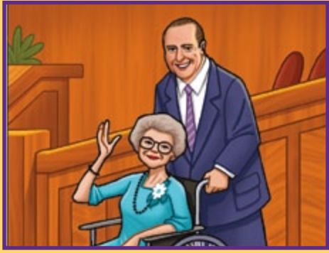
Serving his family