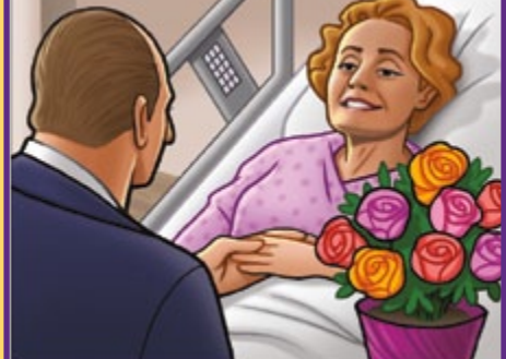
Visiting people in nursing homes