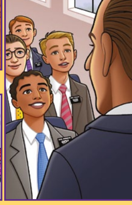
Being a mission president