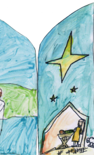
Olivia P., age 9, Texas, USA