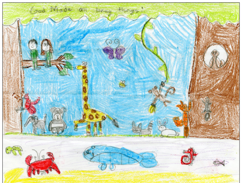
Kayleigh P., age 9, Maryland, USA