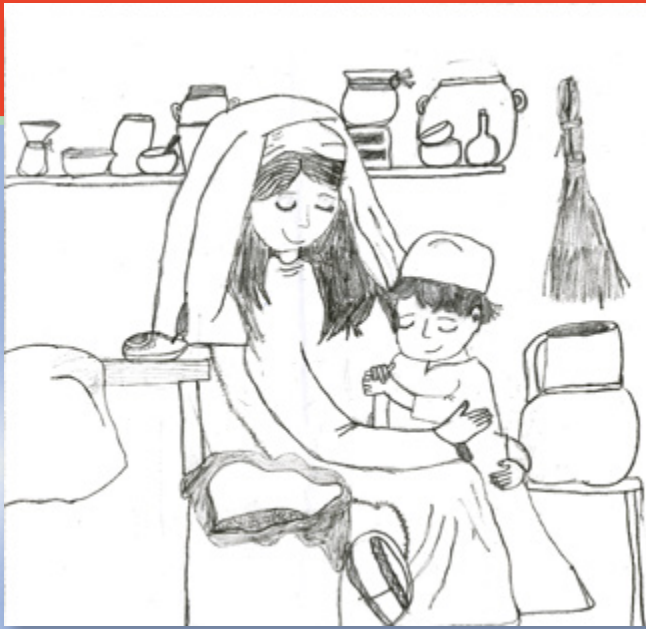
Alexis B., age 9, Utah, USA

Watch a video of children reading scriptures about the Savior at friend.lds.org !