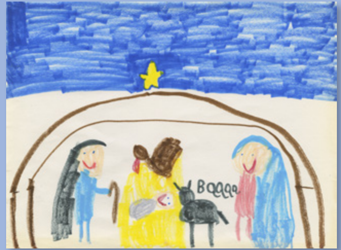
Max A., age 6, Minnesota, USA