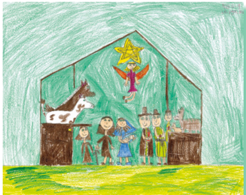
Brooke S., age 9, Nevada, USA