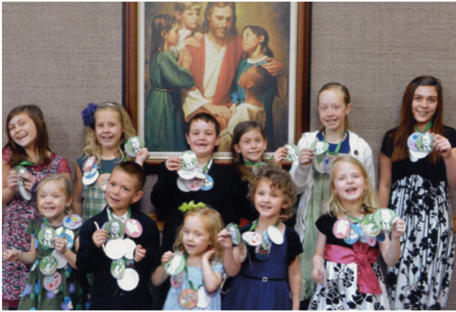
The children of the Crowsnest Pass Branch, Alberta, Canada , put the principles they learned in sharing time into their lives by competing in their own gospel Olympics! They got a medal for each "sport" they did.

A boy at school threw rocks at two girls in my class, and he also kicked rocks at one of the boys. The next day I made friends with him. I found out he just needed a friend. I think Jesus wants us to forgive others when they do wrong things. We should give them another chance.