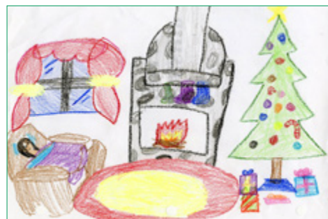
Isyabelle C., age 10, Virginia, USA