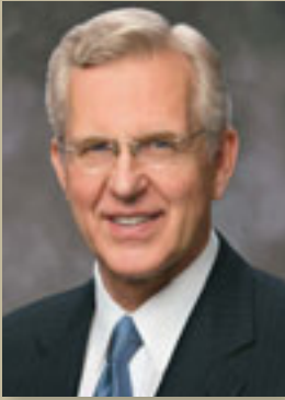
Elder D. Todd Christofferson of the Quorum of the Twelve Apostles shares some of his thoughts on this subject.