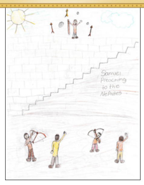
Lauren P., age 11, Utah, USA