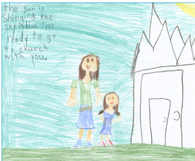
Charlotte T., age 6, Arizona, USA