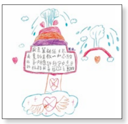
You-en, age 6, Taiwan