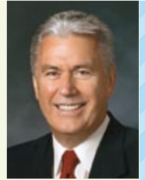
By President Dieter F. Uchtdorf Second Counselor in the First Presidency