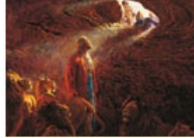
1. A. Daniel 6:22 B. Genesis 7:4

These pictures show events that are recorded in the scriptures. Look at each picture and circle which of the verses underneath describes the event taking place.