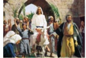
2. A. Matthew 3:16 B. John 12:12-13