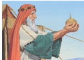
3. A. Alma 46:12 B. 1 Nephi 16:28-29