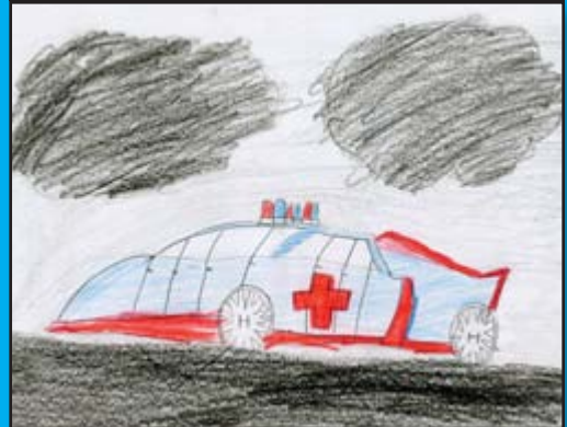
Lincoln F., age 9, South Africa