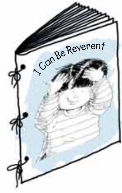
Note: If you do not wish to remove pages from the magazine, this activity may be copied or printed from the Internet at www.friend.lds.org.

Instructions: Color these two pages, and mount them on heavy paper. Cut out the picture pages on the broken lines. Punch holes along the sides of the pages as marked. Place the picture pages on top of each other in order, with the title page on top. Line up the holes, and tie your book together with ribbon or yarn.