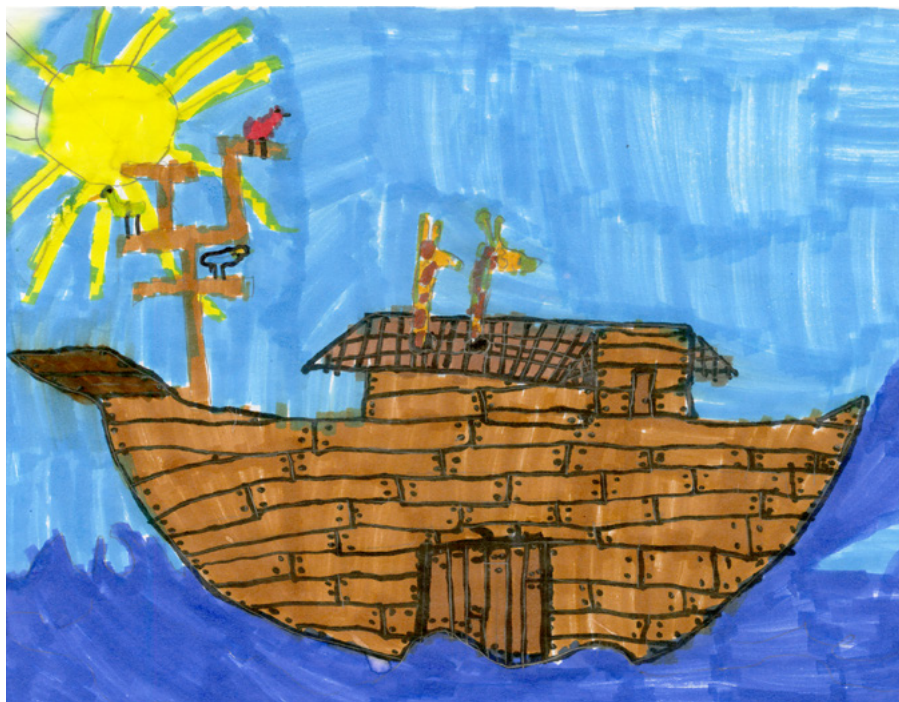
Tyson B., age 9, Utah, USA