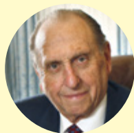
By President Thomas S. Monson