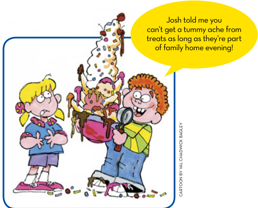
CARTOON BY VAL CHADWICK BAGLEY