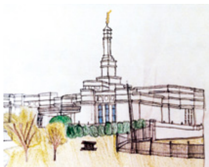
Leo T., age 10, Iowa, USA