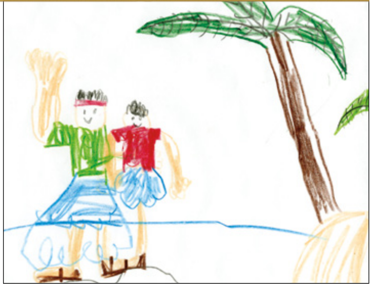
Damon B., age 8, Utah, USA