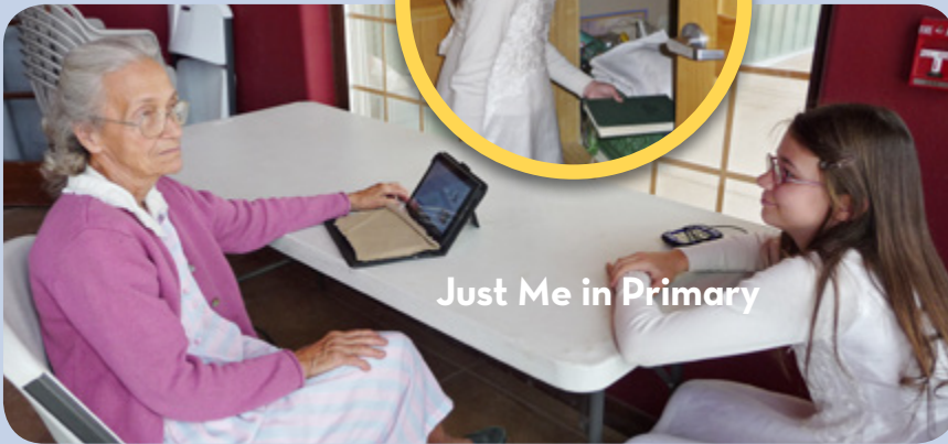
Just Me in Primary

It's pretty interesting to be the only person in Primary. I meet with my teachers in the lobby of the building. We have a lesson and sharing time. I always get called on to answer the teacher's questions!