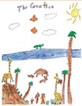
Le Grand T., age 6, Philippines