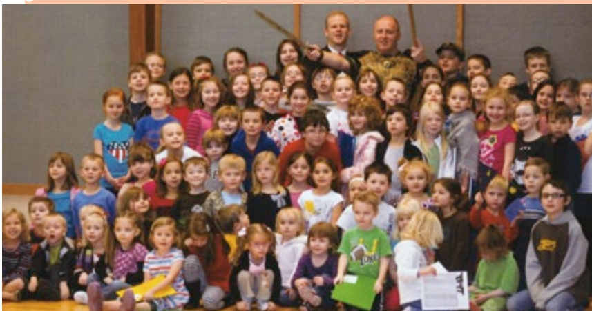
Children in the Charleston West Virginia Stake attended a Primary activity where they learned about Captain Moroni and the title of liberty. Their stake president also taught them about a title of liberty that their stake made.