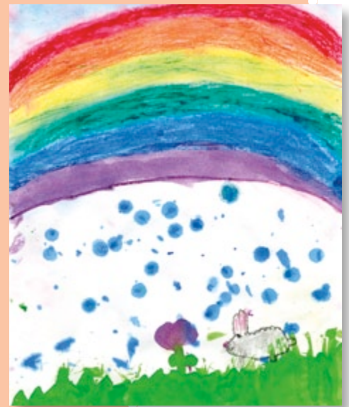
Ande B., age 7, Alaska, USA