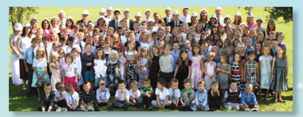
Each week as the Gilbert Arizona Temple is being built, Primary children from the Gilbert Arizona Highland Stake have set a goal to serve someone in their wards.

Sometimes temples are rededicated after they are remodeled. Primary children sang and carried lights in the performance that celebrated the rededication of the Anchorage Alaska Temple.