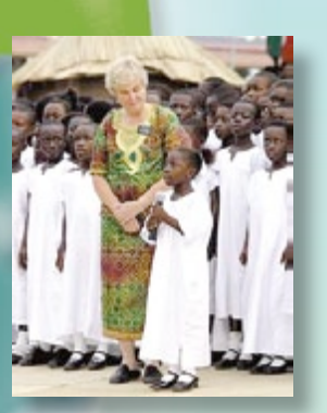
Primary children sang for President Gordon B. Hinckley when he arrived to dedicate the Aba Nigeria Temple.

More than 800 Primary children from West Africa sang "I Am a Child of God" at the cultural celebration before the Accra Ghana Temple was dedicated.