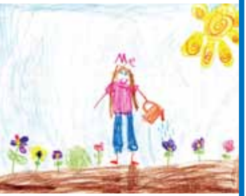
Breely B., age 6, Utah