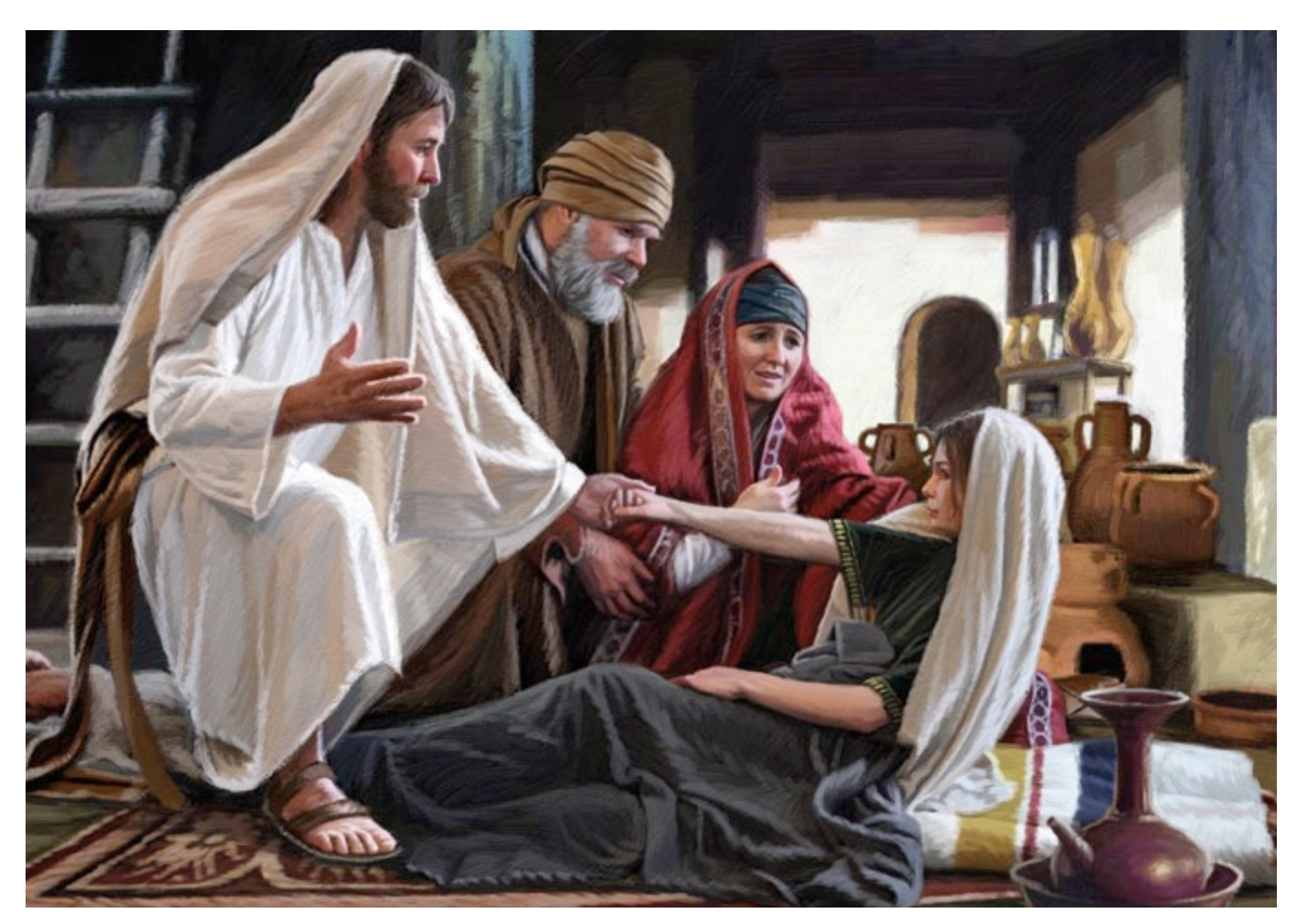
Jesus performed numerous miracles for people during times of need. He healed a leper, calmed the sea, and raised Jairus's daughter from the dead.

and raised Jairus's daughter from the dead. He made whole an infirm man at the pool of Bethesda, healed a deaf man with a speech impediment, and cleansed 10 lepers. Each was in desperate need.