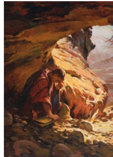
Ether (above) and Moroni (page 34) saw the destruction of their civilizations because of war (see Ether 13:13–14; Moroni 1:1–4).

After a battle which left the “bodies of many thousands . . . moldering in heaps upon the face of the earth,” including some faithful