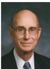
By President Henry B. Eyring