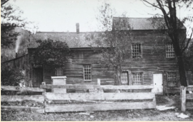
Joseph and his wife, Emma Hale Smith, lived in the single-story portion of this home during part of the translation of the Book of Mormon. The two-story structure on the right of the home was a later addition.